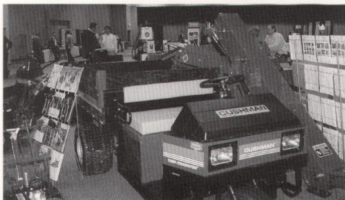
Hanley Implement is one of several exhibitors who has been on every show floor hosted by the WTA.