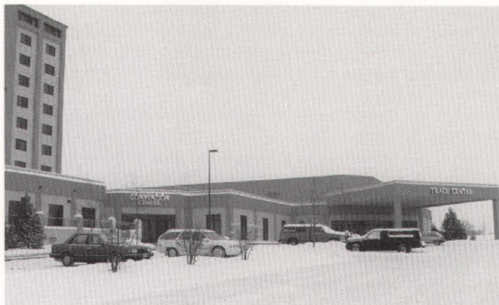
Middleton Holiday Inn—new home of WTA winter meeting.

Many of the people who made it to the meeting will receive an evaluation questionnaire. Those results will be used in the planning of the EXPO 95 program. Count on it being even better. 🌱