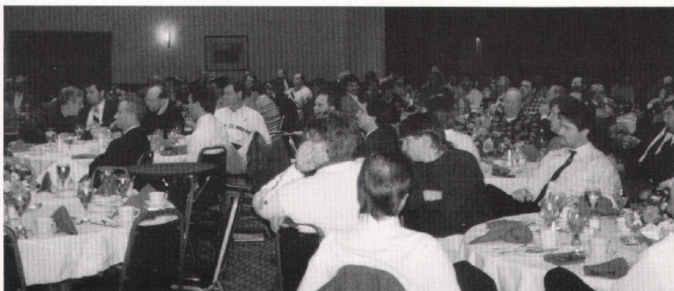
There was a very nice noon luncheon crowd.