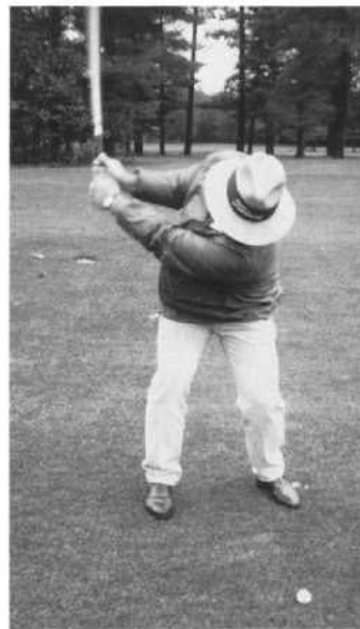
The unknown golfer. Check the grip.