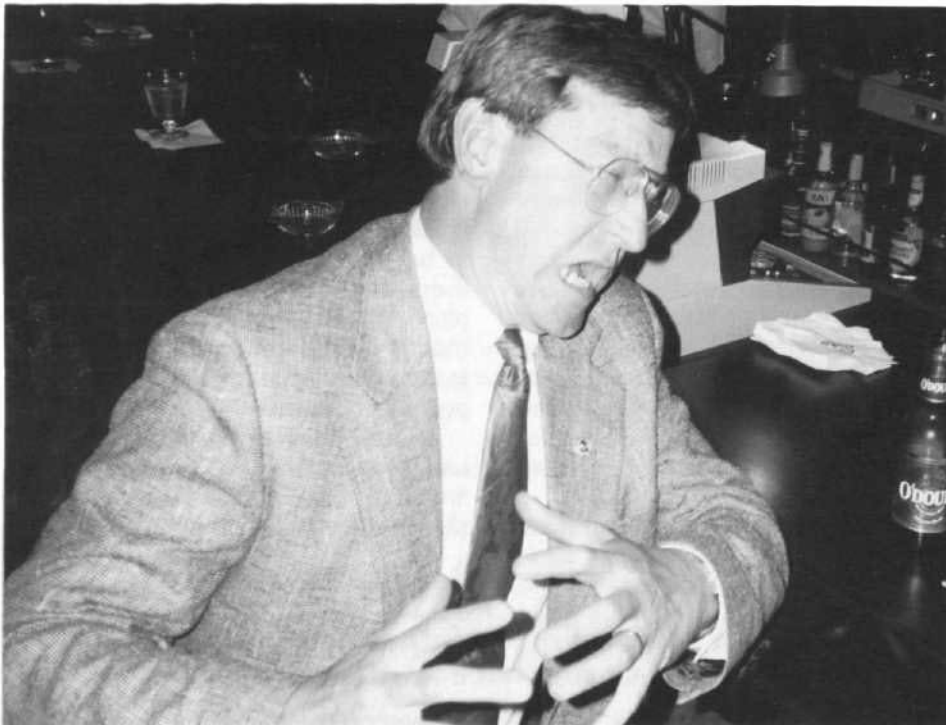
"And then she stepped on my foot!"

1993 will mark the tenth anniversary of this event. We "seasoned veterans" extend a most sincere invitation to everyone to attend. 🙌