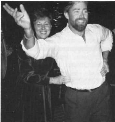
Are we having fun yet?