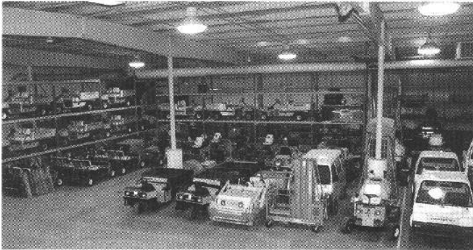
Good design at Blackwolf Run allows for the storage of a tremendous amount of equipment.

Thanks to cooperators noted here, take a look at the photos for a look at the newest and best shops in our state.