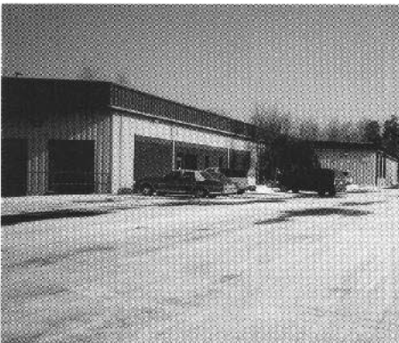
The earliest of the new generation of shops was probably the one at SentryWorld. Ten years later, as shown here, it's still an excellent facility. Thanks to Gary Tanko for the pics.