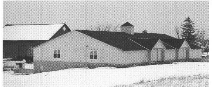
Bob Erdahl's new building at North Shore reflects its very urban setting and concomitant zoning requirements. It is flanked by the barn it replaces and also some very expensive homes. This shop looks like a very nice stable. I like to call this beautiful building "the Yuppie Shop" (because of its appearance, not Erdahl's status!)