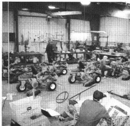
One of the really impressive things about the SentryWorld facility is its enormity. This is a look at one little corner.