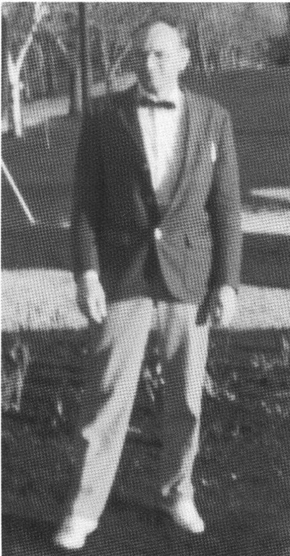
8. The man shown in this photo is no longer a golf course superintendent, but his son is. Name the man with white bucks and the bow tie.