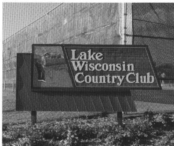
Site of the July meeting, Lake Wisconsin C.C.