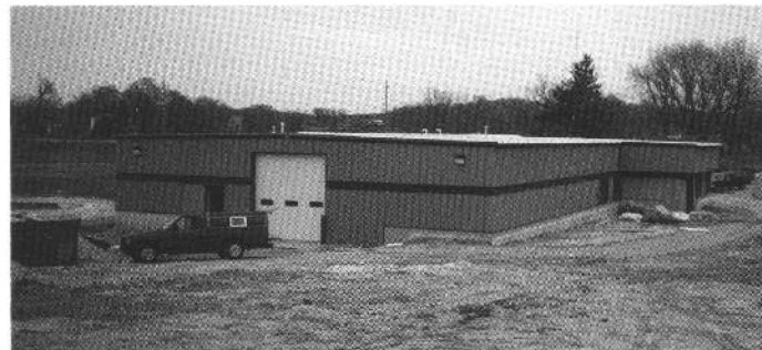
This photo affords a view to the northeast.