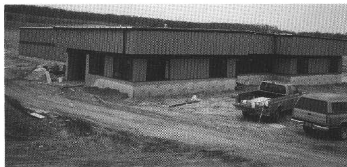
The NOER CENTER building as you look to the northwest.