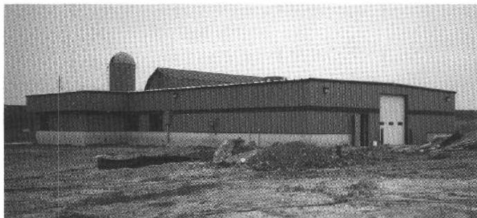
A view looking southwest.