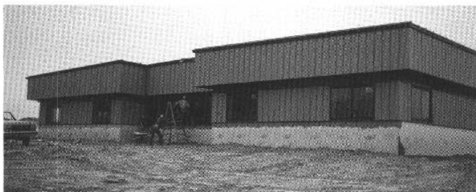
The building as it appears looking to the southwest.

Should you ever find yourself in Madison, please drive out to the NOER CENTER and see it for yourself. We are anxious for everybody to see what an industry can do to help itself.