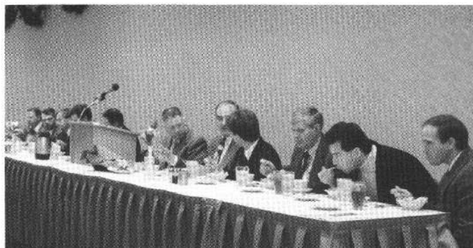
The head table was a veritable "Who's Who" in the Wisconsin turfgrass industry

American Excelsior Co. The Andersons Bliffert Lumber Company Ciba-Geigy Turf & Ornamental Clifford Sales & Marketing DowElanco Hanley Horst Distributing, Inc. Kellogg, Inc. Seed & Supplies Knox Fertilizer Lebanon Total Turf Lesco, Inc. Milorganite Div of MMSD Mobay Corporation Nor-Am Chemical Northrup King Co. Pendleton Turf Supply Reinders Irrigation Reinders Turf Rhone Poulenc O.M. Scott & Sons Seaboard Seed Company Spring Valley Turf Products Standard Golf Company Tractor Loader Sales Tyler Enterprises Vigoro Industries, Inc. W.A. Cleary Chemical Corp. Waupaca Materials/Greenmix Wilbur Ellis Co/Brayton Chemicals Div Wisconsin Sod Producers Wisconsin Turf Equipment Corporation