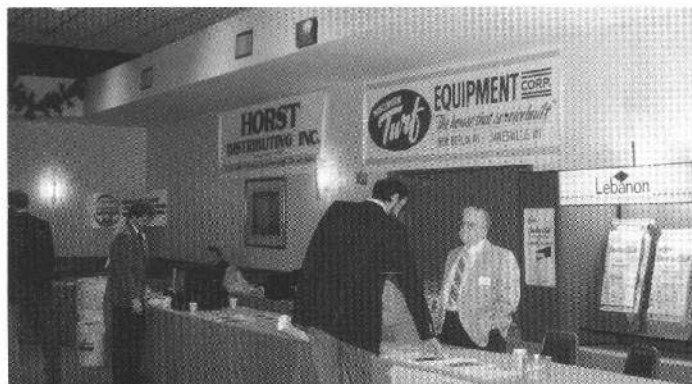
The tabletop exhibits get better every year.