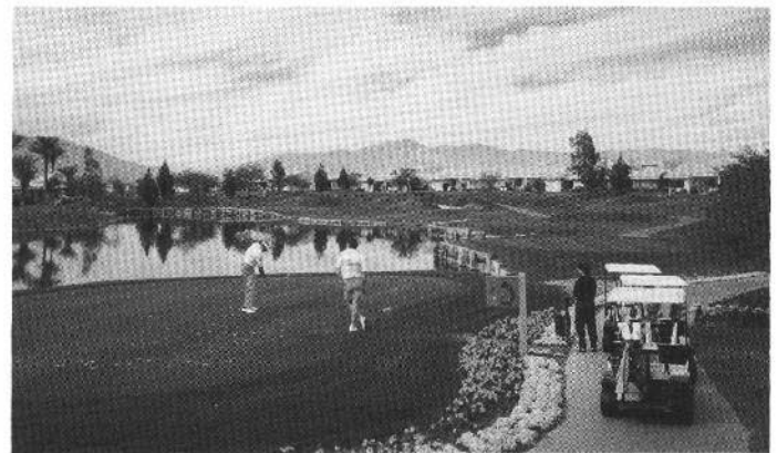
The Monroe Country Club team on the 8th green.