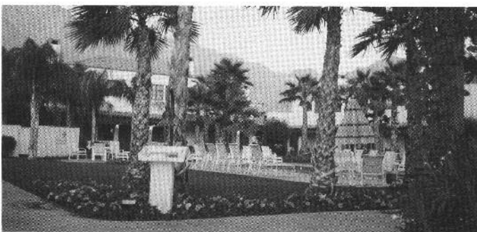
The living quarters were as beautiful as the golf course itself!