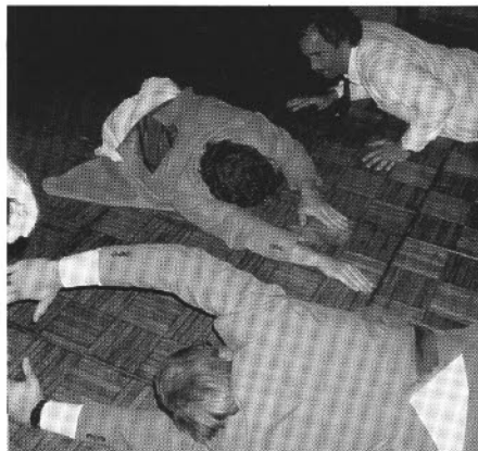
Someone dropped a nickel!