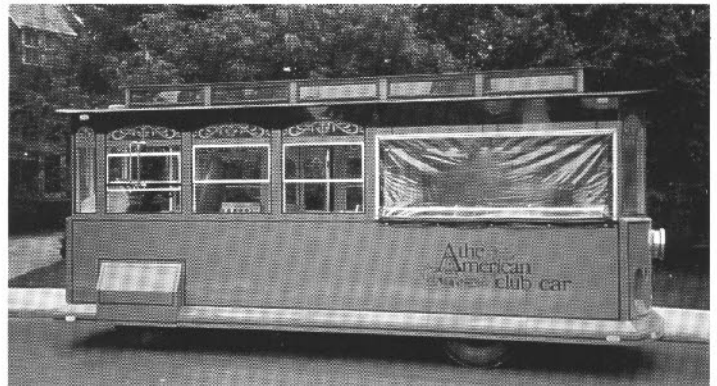
The Club Car is available if you need a ride to Blackwolf Run.