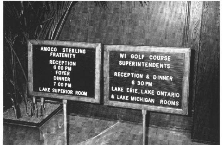
The American Club was a beautiful place to enjoy dinner and have a meeting.