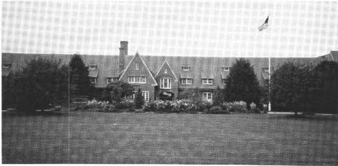
The American Club is the only 5 star hotel in Wisconsin.