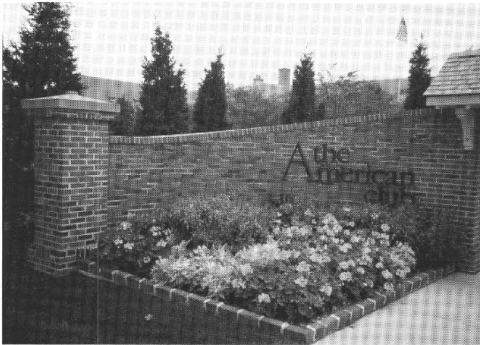
The American Club is part of the world class recreation/hospitality facilities in Kohler.