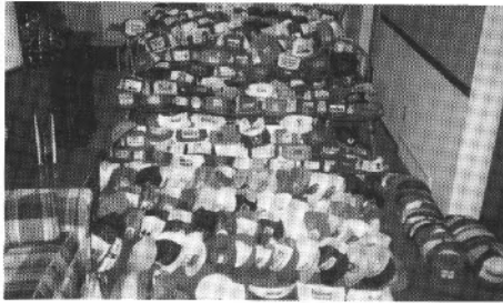
This is a photo of approximately one-half of M. Miller's golf turf and ag hat collection!