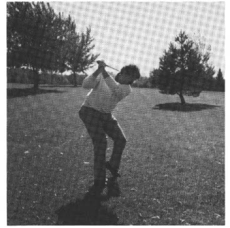
Walk lightly, but carry a big stick!