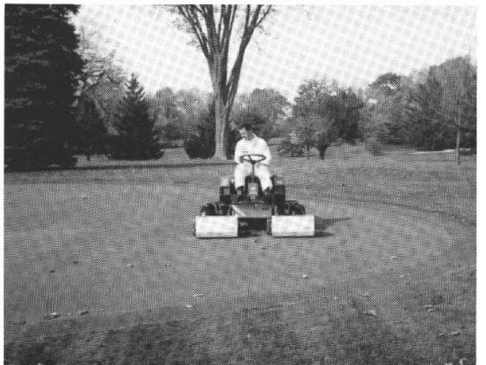
Another unit to choose from when selecting a greensmower - The Ransomes GT.