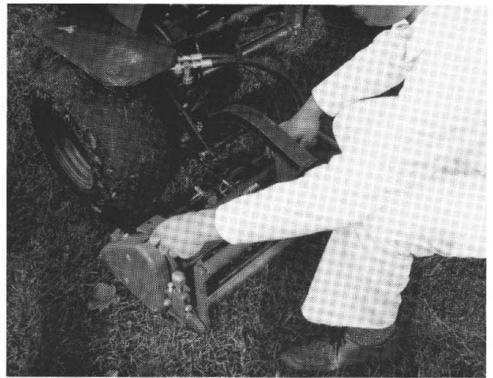
The cutting units are easy to remove.