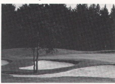
The Lake Arrowhead property provides a beautiful setting for one of Wisconsin's finest golf courses.

Top Dressing8000Top Dressing with soil9000Bunker Sand3050