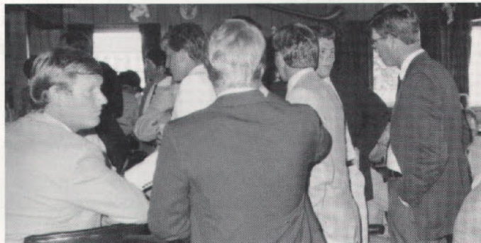
Members and guests enjoyed the "Swiss" hospitality of Monroe Country Club.