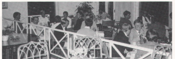
Elegant was the word best describing the banquet.