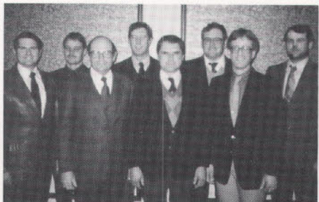
1986 WGCSA Officers and Directors.