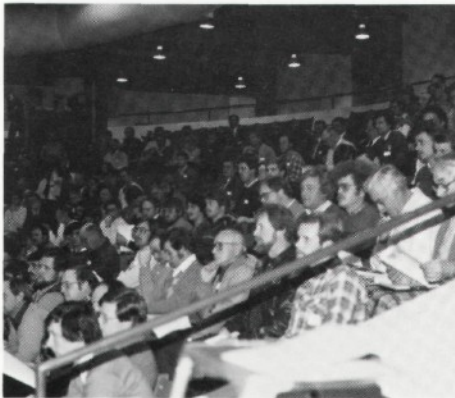
Attendees gathered for annual meeting.