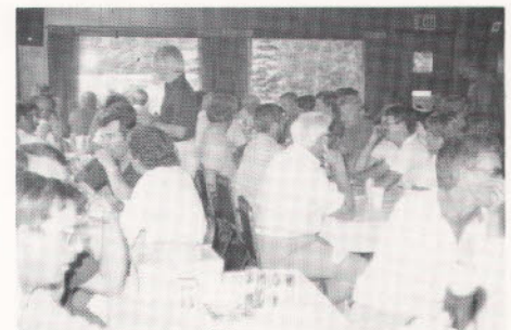
Part of the overflow crowd at the June meeting.