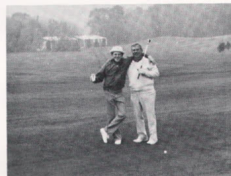
Hands down winners of the ugliest couple award.