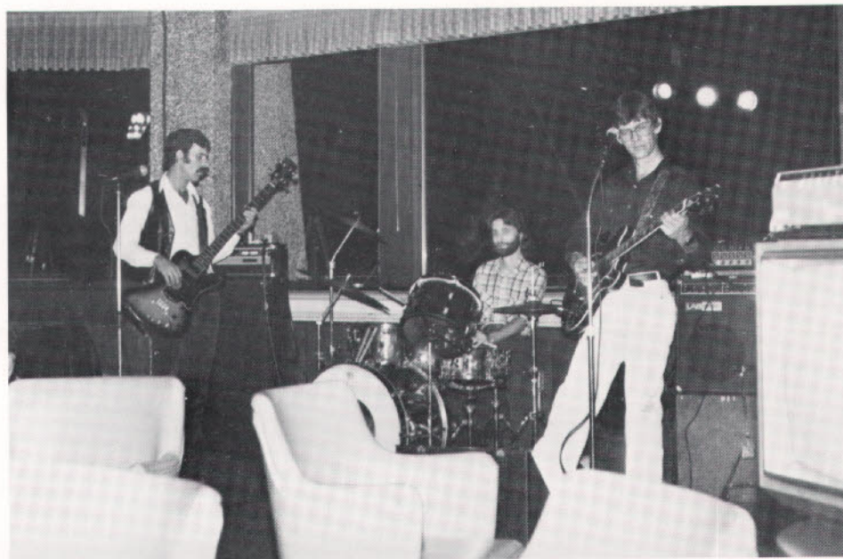
The Tempo Trio Go Ziggy Go!

Once again, I thank everyone in attendance and who knows maybe now this famous event will become an annual event.