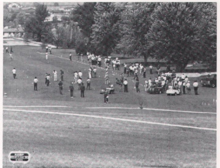
Panoramic view of group inspection of research plots.