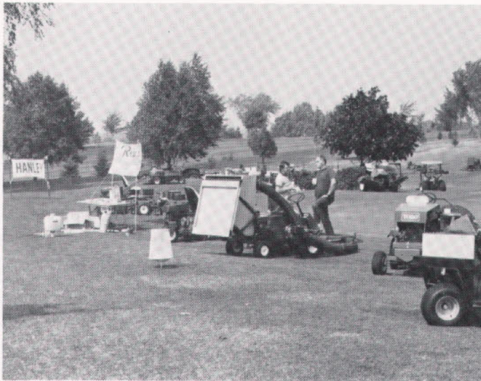
Equipment was available for "hands on" use.