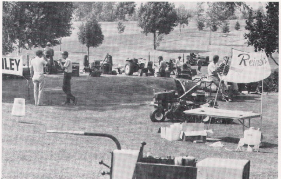
A full spectrum of equipment was available for inspection and demonstration.