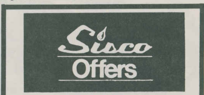
THE FINEST TURF SYSTEM.... .custom designed to meet your Club's specific needs.

This is particularly evident in the case of turf maintenance equipment where both the equipment and the fuel supply may be stored during the off-season. If you want to use gosohol or any other synthetic fuel in your equipment, you should check first with the dealer or the manufacturer.