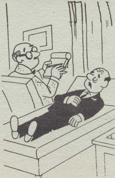
IT'S POA AGAIN DOC