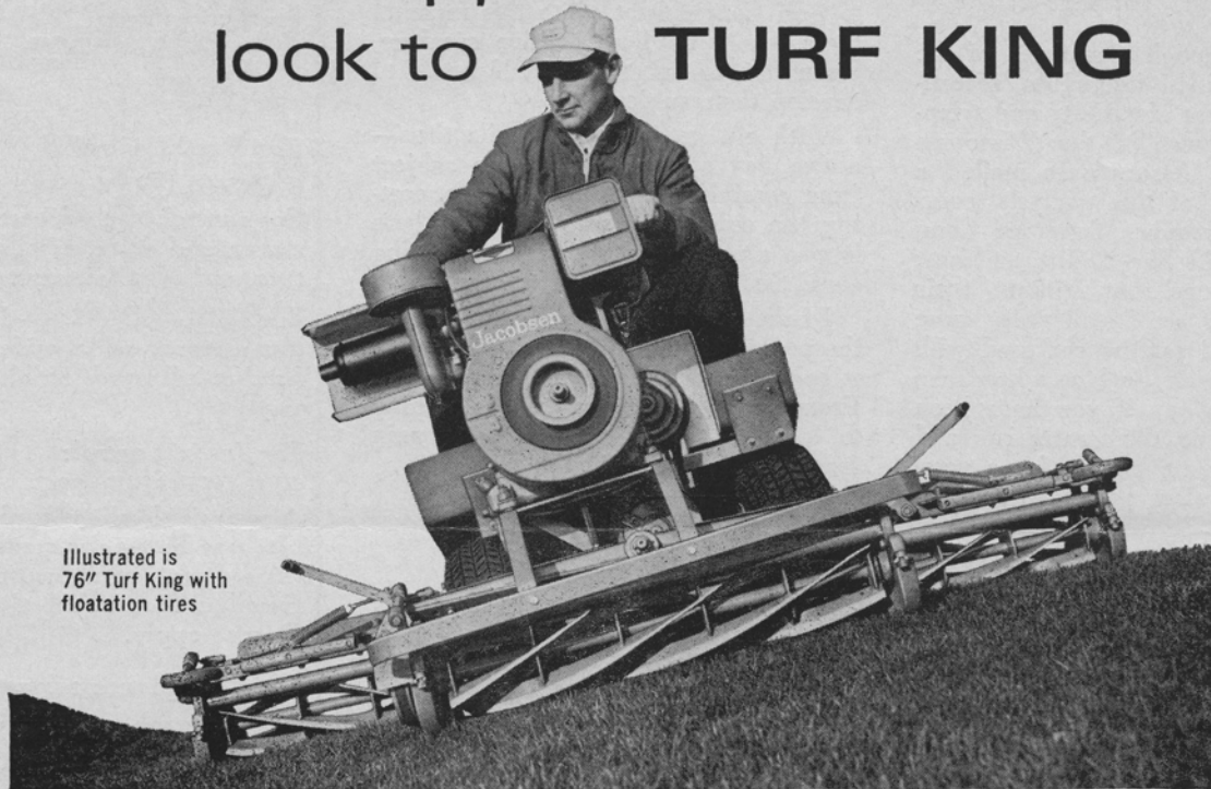
Illustrated is 76" Turf King with floatation tires

The Jacobsen Turf King—versatile mower with the velvet touch. Ideal for country clubs, golf courses, parks, schools and campuses—wherever fine turf is an appearance asset, and safe, cost-saving operation is essential.