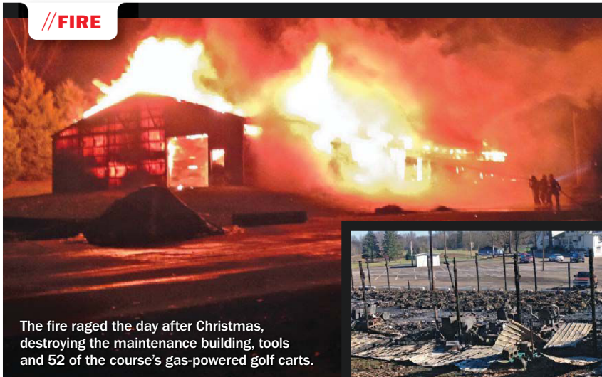
The fire raged the day after Christmas, destroying the maintenance building, tools and 52 of the course's gas-powered golf carts.