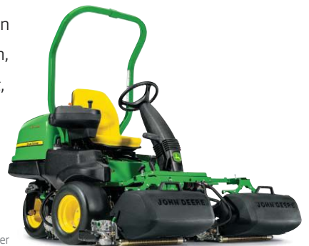
2500E-Cut™ Hybrid Greens Mower