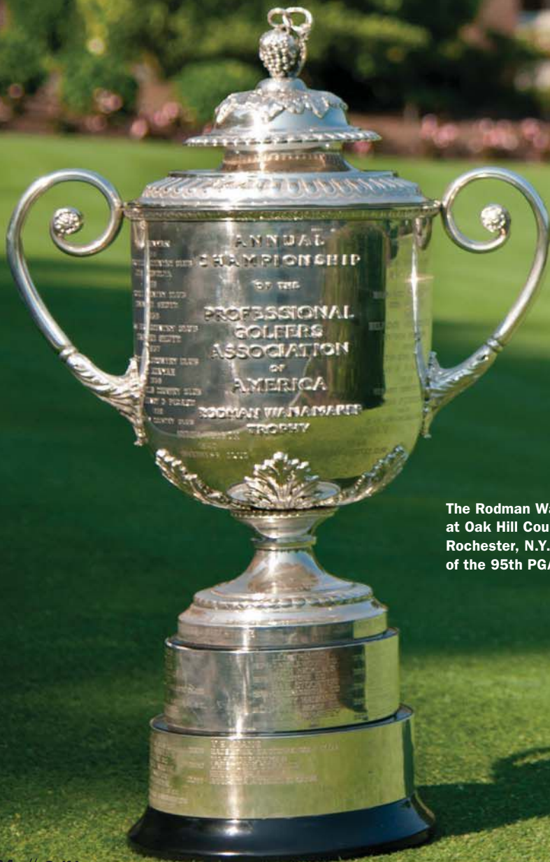
The Rodman Wanamaker Trophy at Oak Hill Country Club in Rochester, N.Y., the site of the 95th PGA Championship.