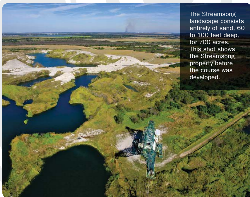
The Streamsong landscape consists entirely of sand, 60 to 100 feet deep, for 700 acres. This shot shows the Streamsong property before the course was developed.

“A flagstick is about the only vertical thing you’ll see on the course,” says Sunnarborg. “We’re not anti-ball washer, but it was a conscious decision. It’s a minimalist