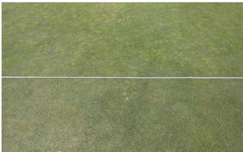
Untreated creeping bentgrass putting green turf can be seen above the tape measure; methiozoline-treated turf can be seen below it.

PoaCure (methiozoline) is an experimental use permit herbicide that has high activity against annual bluegrass ( Poa annua ) on greens. Several tests are being conducted on creeping bentgrass greens at both low and high elevation locations in Arizona. The research objective is to determine if repeat fall applications differ from repeat spring applications for the elimination of annual bluegrass. Initial testing shows good creeping bentgrass tolerance and that perhaps a fall application program is more effective in annual bluegrass removal than a spring program. Contact David Kopec, Ph.D., of the University of Arizona at dkopec@ag.arizona.edu for more information.