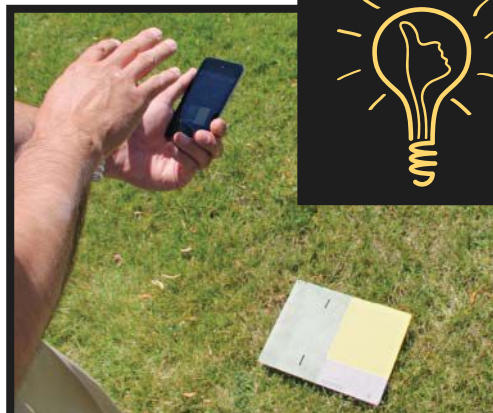
Through a photo taken by a smartphone, the GreenIndex will give superintendents an exact measurement of how green the grass is.

ments more consistent and objective. The app can assist in making decisions associated with declining greenness. It's a tool to help keep turf in the optimal range, not over- or under-fertilized," Rusciollelli says. "Once it's calibrated anyone can go out and take the measurements."