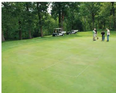
The research site on the Ackerman Hills Golf Course at Purdue University.

The objective of this experiment was to determine the optimum rate and timing of spring applications for annual bluegrass control. The experiment was conducted in Knoxville, Tenn. and West Lafayette, Ind. Individual applications in March, April and May, or programs of March + April, April + May or March + April + May at two methiozolin application rates (0.45 or 0.9 lbs./acre) were tested. Applications were made at the first of each month in Tennessee and the middle of each month in Indiana. Results from both locations concluded that sequential applications which contained the early spring (March) applications provided the best efficacy.