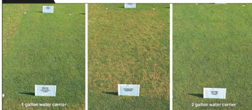
Impact of water carrier volume on the efficacy of Secure — Penn State, University Park 2012.

Secure fungicide has been evaluated in dollar spot efficacy trials to compare it to other multi-site fungicides; determine optimal water carrier volume; evaluate its efficacy when applied through different