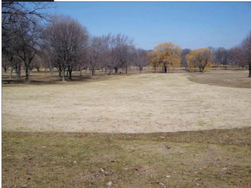
Gray snow mold, caused by Typhula incarnata , can decimate turf under snow cover for 60 days or more. Note the sharp line delineating between sprayed and non-sprayed turf at this course in Wisconsin.