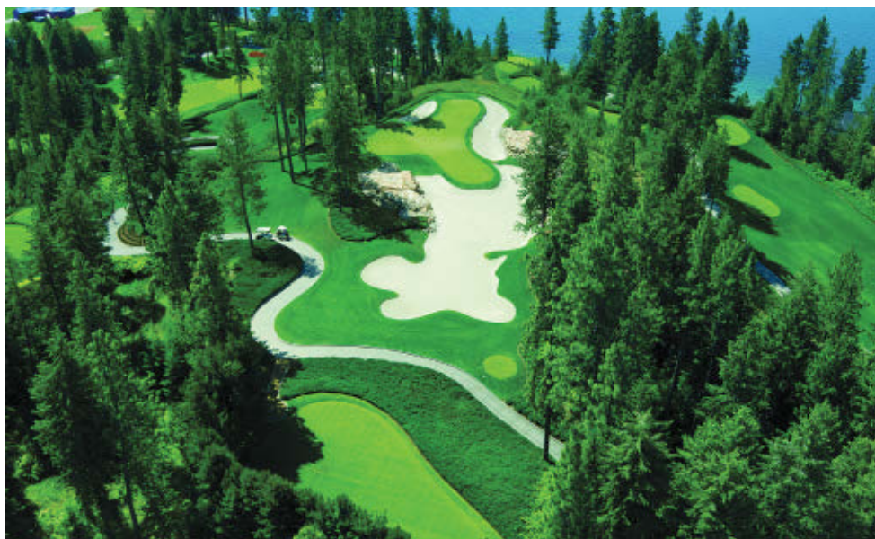
An aerial view of Coeur d'Alene Resort.