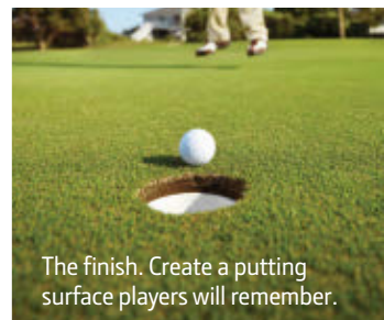
The finish. Create a putting surface players will remember.