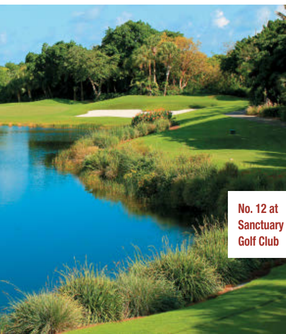
No. 12 at Sanctuary Golf Club