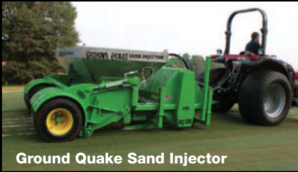
Ground Quake Sand Injector