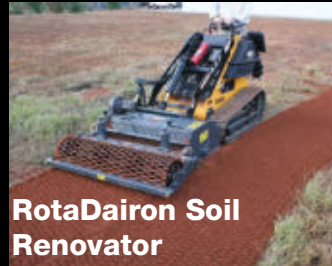
RotaDairon Soil Renovator