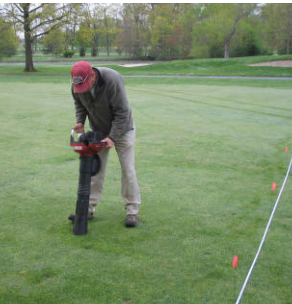
A modified blower/vacuum collects ABWs to measure the population.

We conducted field studies over a two-year period to find new approaches to monitoring overwintered adult populations and potentially forecast larval densities. Since adults are easier to see (and therefore monitor) than larvae, we sought to determine if a modified leaf blower/vacuum could provide a rapid and accurate estimate of ABW adult density and