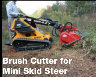
Brush Cutter for Mini Skid Steer