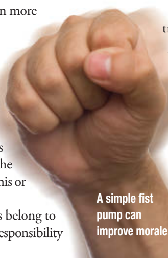
A simple fist pump can improve morale.