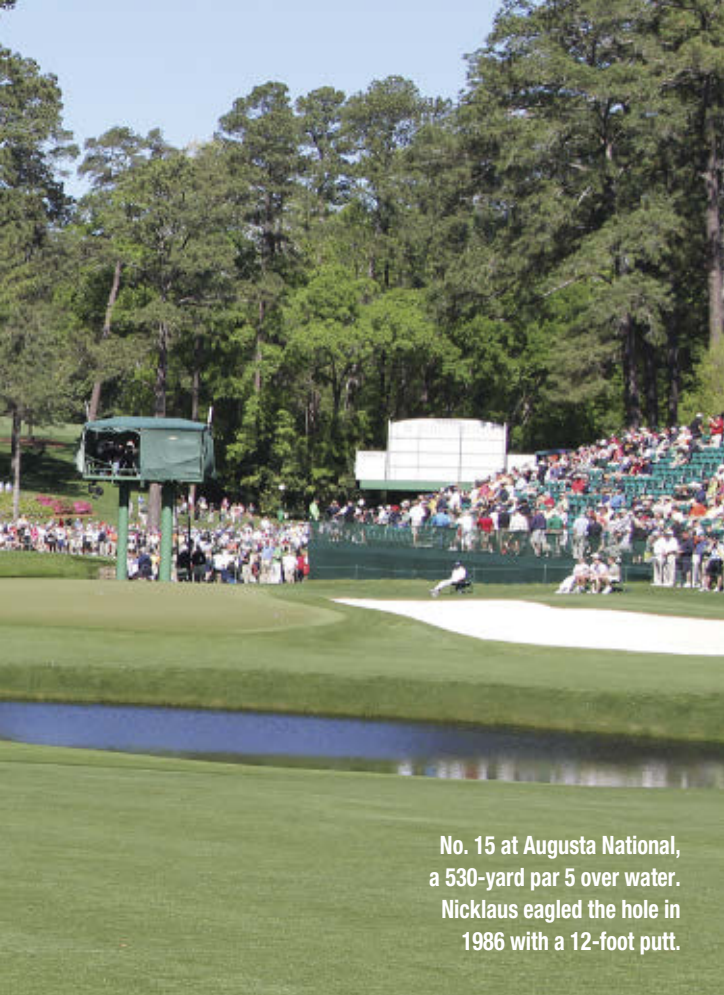
No. 15 at Augusta National, a 530-yard par 5 over water. Nicklaus eagled the hole in 1986 with a 12-foot putt.

he hadn't won a major since the 1980 PGA Championship six years earlier, and he hadn't won a green jacket in 11 years.