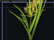
YELLOW NUTSEDGE [SUPPRESSION]

G pbi / gordon corporation An Employee-Owned Company