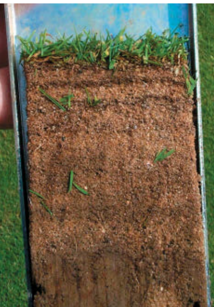
Soil layering resulting from topdressing. Note how thatch is sandwiched between successive topdressings.