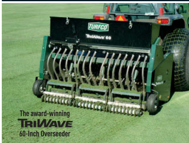
The award-winning TriWave 60-Inch Overseeder

EXPERIENCE THE NEXT WAVE IN OVERSEEDING.