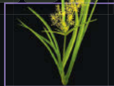
YELLOW NUTSEDGE [SUPPRESSION]

G pbi / Gordon corporation An Employee-Owned Company