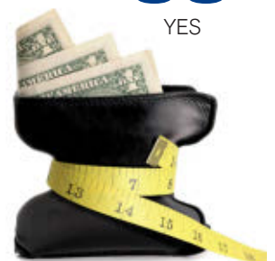
Golfdom Survey: Based on 575 responses