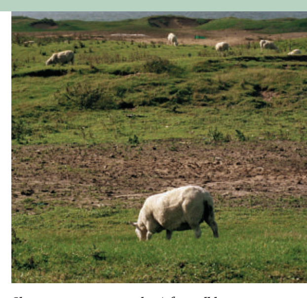
Sheep are a common sight. A few will be allowed to wander the grounds during the peak season.

Keating says he had no problem working within the environmental dictates and that