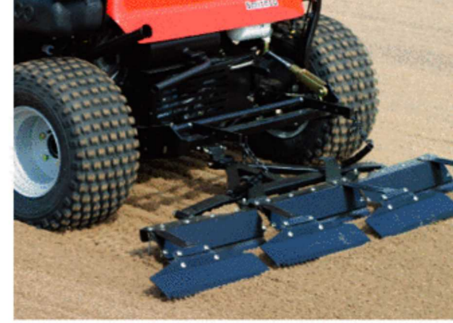
Tournament Finish Rake