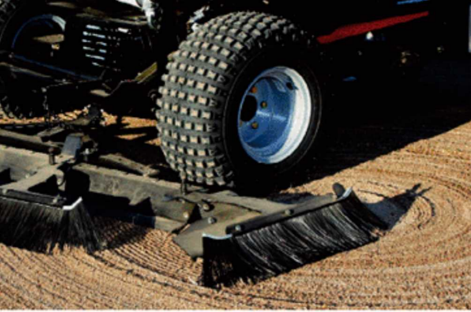
Tournament Star Rake