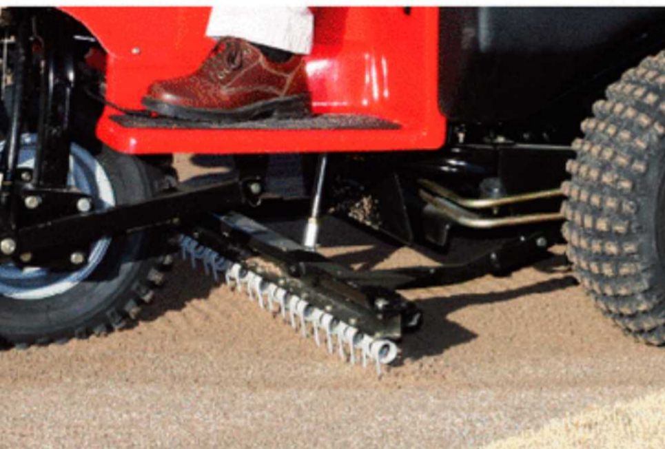
Spring Tine Sand Cultivator