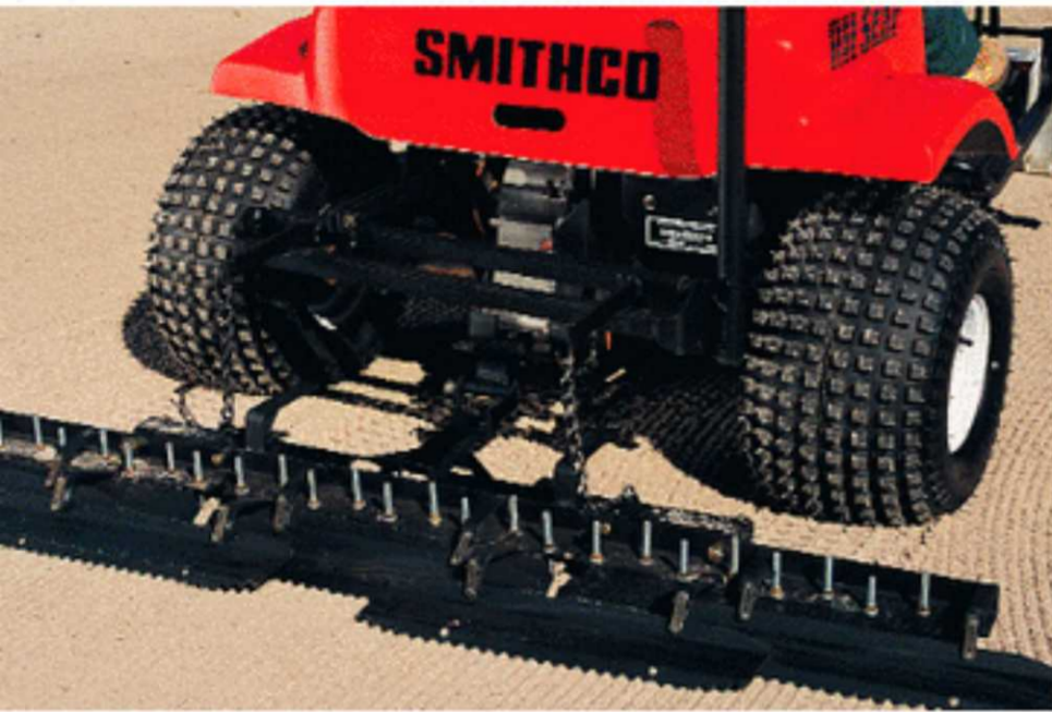
Standard Finishing Rake