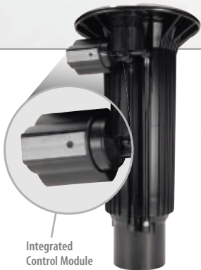
Integrated Control Module

Introducing the NEW Rain Bird® IC™ System, a revolutionary control platform that directly links your rotors to your central control. Our innovative Integrated Control Technology™ uses up to 90% less wire and 50% fewer splices, while eliminating satellite controllers and decoders and saving precious water. It's also more peace of mind, simpler installation and reduced maintenance. Now that's The Intelligent Use of Water.™