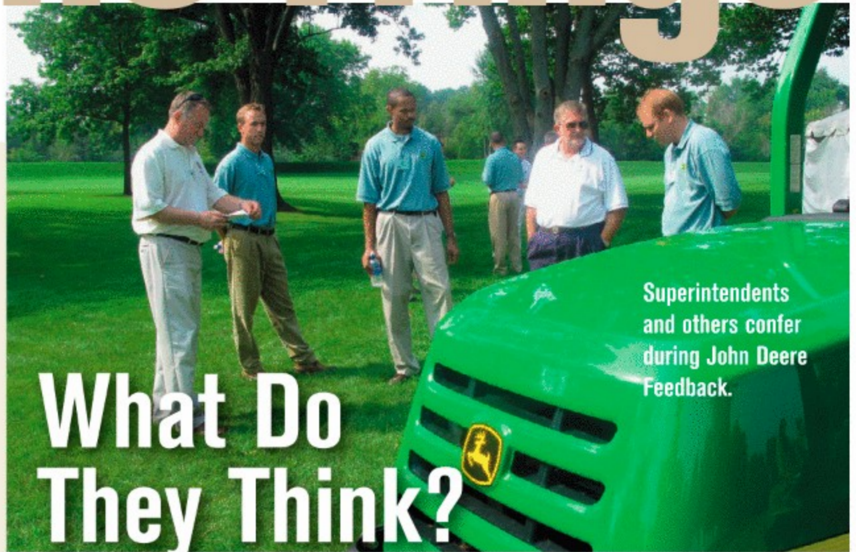
Superintendents and others confer during John Deere Feedback.