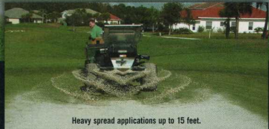
Heavy spread applications up to 15 feet.

Turf-Truckster®, John Deere ProGator™ or Toro® Workman®. For a demo or to request product information, call 1-800-679-8201 or visit turfco.com .