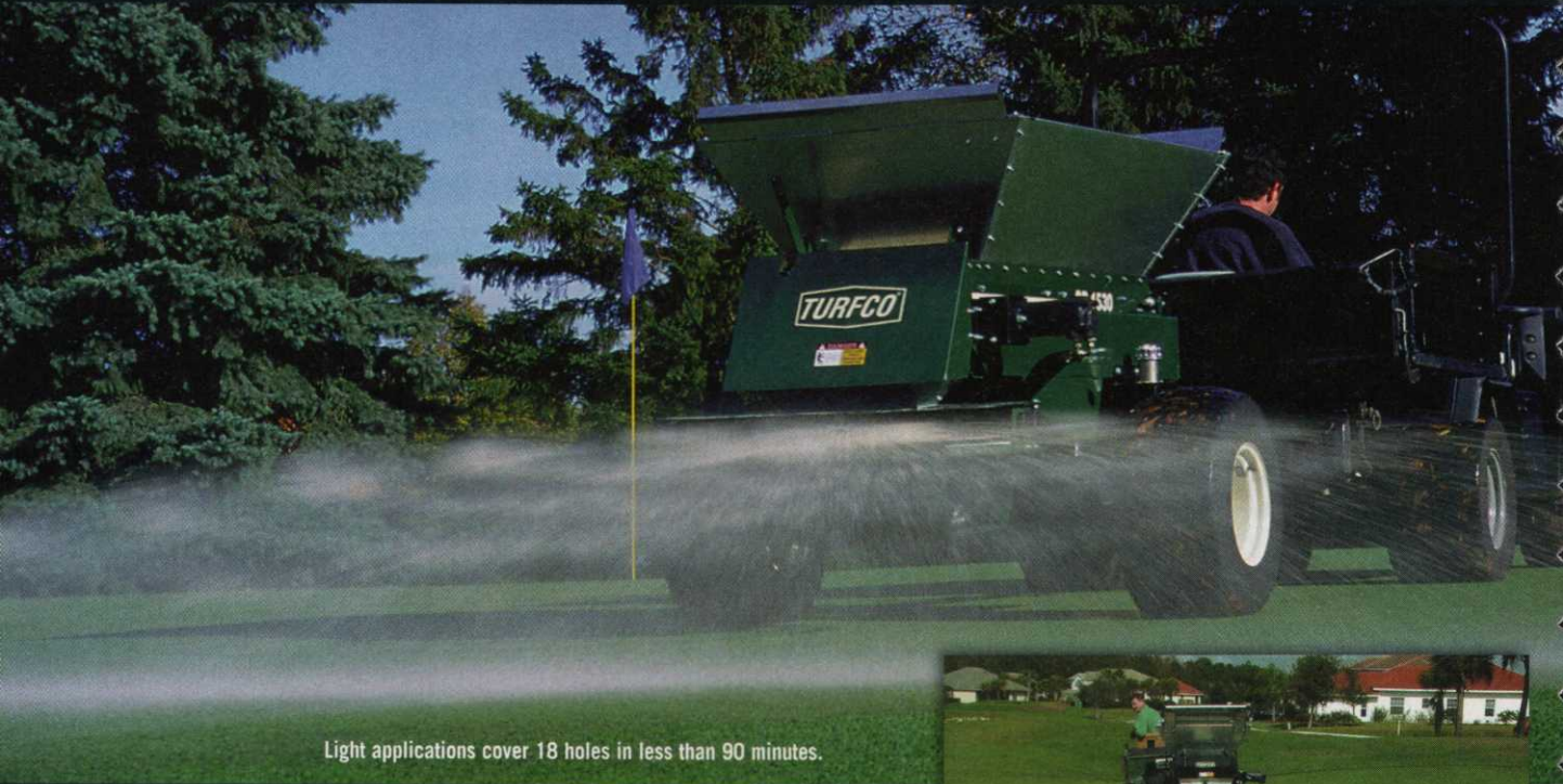
Light applications cover 18 holes in less than 90 minutes.