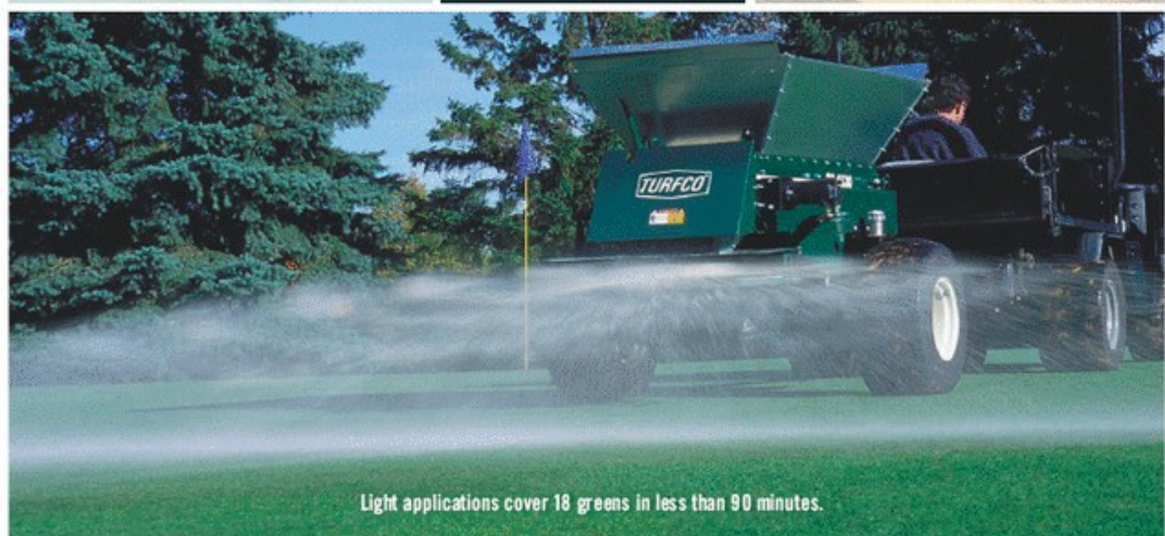
Light applications cover 18 greens in less than 90 minutes.

After 45 years of experience, Turfco® is the #1 brand of topdressers and material handlers.