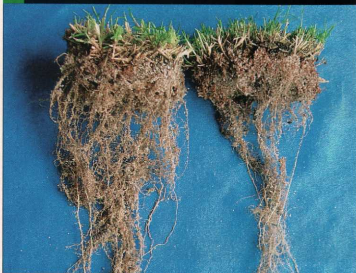
Root biomass comparison of Celebration (left) and Tifway bermudagrasses following eight weeks of 64 percent continuous shade.