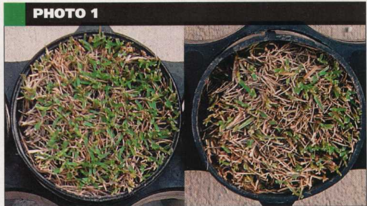
Visual quality comparison of TiftNo.4 (left) and Tifway following five weeks of 64 percent continuous shade.

Bermudagrasses are the most popular warm-season turfgrass in warmer climate zones in the country (Shearman, 2006). In order to assist turfgrass managers when