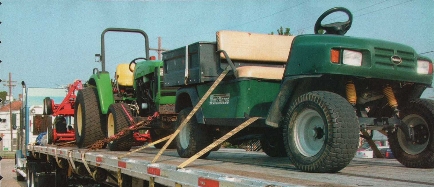
The equipment arrived on two 18-wheel trucks on a steamy June day.