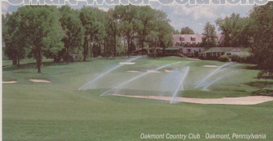
Oakmont Country Club • Oakmont, Pennsylvania

“Hiring a professional irrigation consultant is very important to the success and outcome of a major irrigation installation or restoration project. The planning and specifications, prepared by a professional consultant, lay the foundation for lasting solutions that achieve environmental and business objectives.”